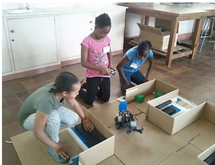
Students from the 2015 camp demonstrating their robots

The Level I, introductory camp, is open to new students who are no less than 9 years and no more than 13 years by July 1 st , 2016. The Level II, more advanced camp, is open to those students who completed the introductory camp last year. The camps runs from July 4 – Aug 5, 2016. To apply, visit http://caribeanscience.org/projects/junior_robotics_camp.php . The deadline for student applications is May 15 th , 2016. Professor Warde also announced that "we are also looking for facilitators for the camps. Interested persons should visit the website and fill out the application."