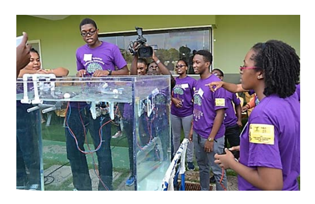
Students maneuvering their underwater robots at CADSTI/CSF's 2015 summer SPISE program

For donations to a CADSTI branch, please make direct contact with the branch.