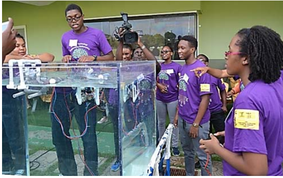
Students maneuvering their underwater robots at CADSTI/CSF's 2015 summer SPISE program